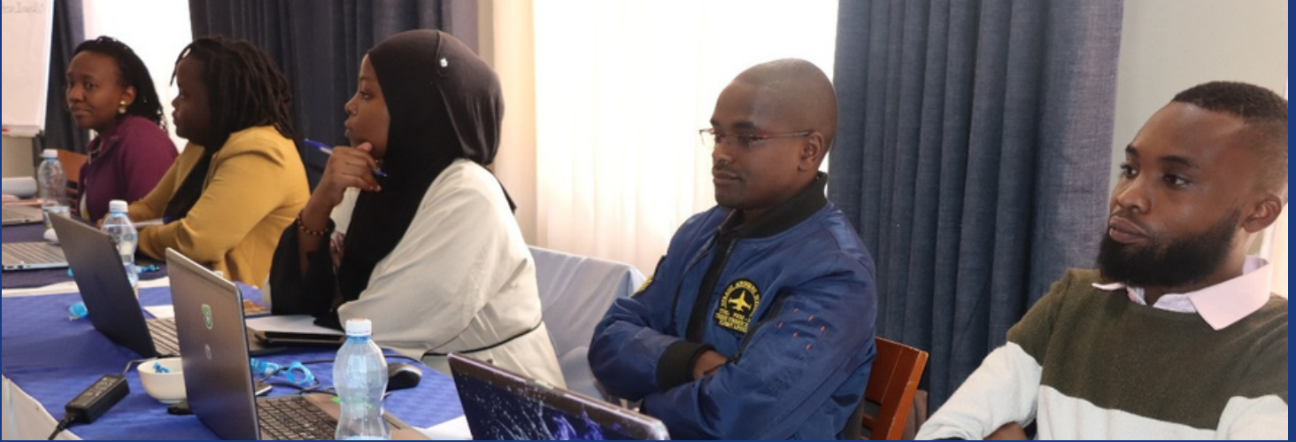
KNQA interns keenly follow proceedings during a Business Process Re-Engineering Workshop in Naivasha.